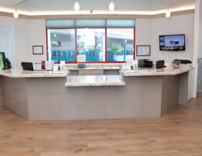
The reception area overlooking the swimming pool and courtyard