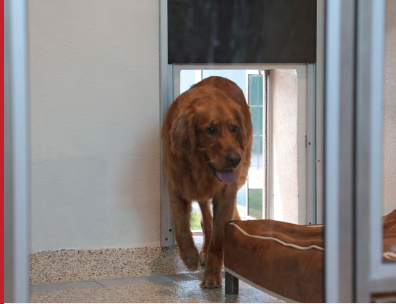
Above: Cooper enjoys the indoor/outdoor freedom of his deluxe Promenade suite