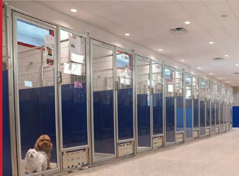
Below: Luxurious accommodations with private patios for pups