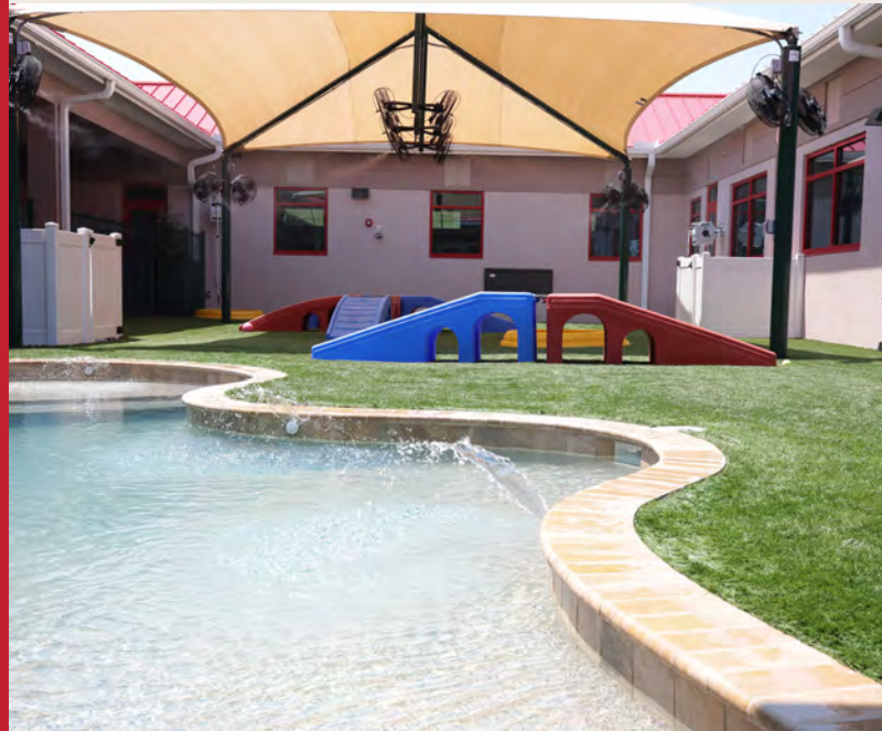
Above: The swimming pool & canopied courtyard with refreshing misters